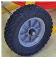
All Terrain Wheels Kit Includes Shaft, Spacers, Wheels, Lock Collars, And Hex Wrench