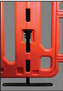
feet rotate and lock for stacking

To lock feet, rotate foot and push down on top of barricade. To release lock, stand on foot and pull up barricade.