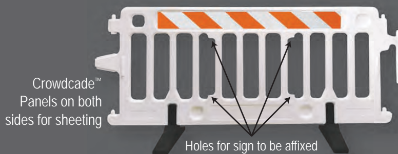
Crowdcade™ Panels on both sides for sheeting