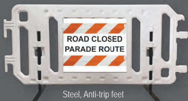
Steel, Anti-trip feet