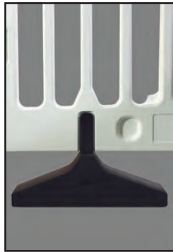
feet rotate for stacking