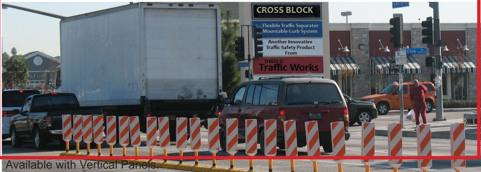
Available with Vertical Panels.

Lightweight, easy and economical to install using 2 anchor bolts for each 36" curb section to permanently install CROSS BLOCK on a variety of substrates. The modular, interconnecting curb sections allow the CROSS BLOCK to be easily shaped to fit the requirements of any job site and conform to the contours and variations common on roadways.