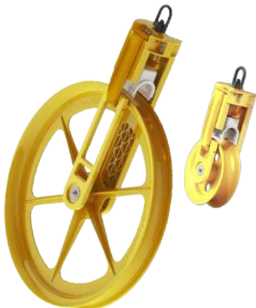
8" Model For Straight Pulls 24" Model For Set Up, Take Down, Turns

Use with jacketed cables 2" or less diameter; loads not to exceed 1600 lbs.