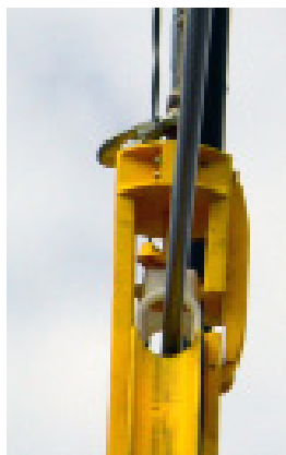
Cable Capture Prevents Pull Tape Or Cable Jumping Edge