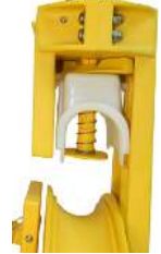
Cable Capture Retracts For Easy Loading and Unloading (Patent Pending)