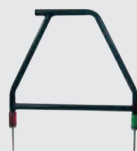
vLoc3 Accessory A-Frame