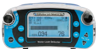
LD-18 Amplifier showing filter settings, bar graph and numeric display of sound loudness, and minimum sound level detected

All-digital amplifier with automatic noise reduction of intermittent sounds, high and low filters, storage and graphing of sound levels at different locations on the pipe, bar graph and numeric display of sound loudness, USB connection, and back light.